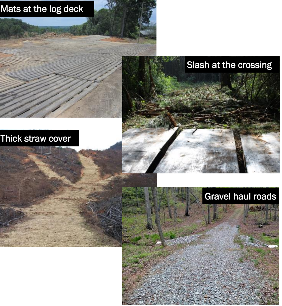
{Continued on page 2}

Winter can be a challenging time to stabilize and cover exposed soil, however, it is important that it gets done. Grass seed doesn't grow well in the cold weather, but here are some other alternatives to grass cover this winter: