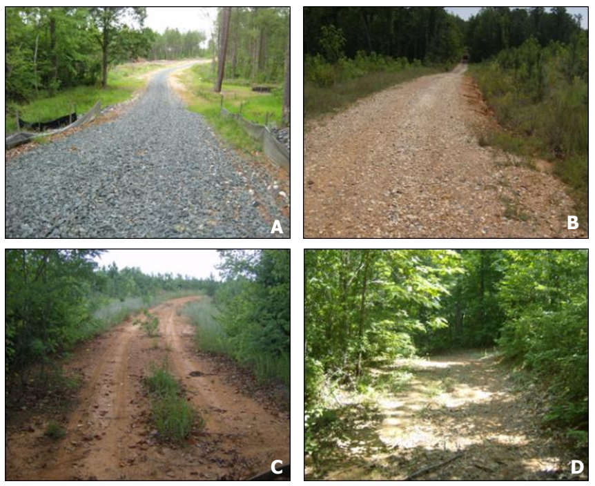
Examples of different haul roads in the Piedmont with photo A having the highest road standards, photos B and C having intermediate road standards and D having the lowest road standards.

Road standards describe the quality of a road and are based upon road usage. Road gradient, curvature, cut and fill ratios, and subgrade width are examples of individual road 'standards'. A minimum standard forest road provides a desired level of utility (i.e., amount and weight of traffic) and environmental protection (i.e., complies with State and Federal rules) at the lowest cost. Decisions on the levels of road standard are affected by available funds, site features, projected current and future road use, degree of concern for environmental impact. Regardless of these factors, basic road standards should provide runoff control , grade control , and appropriate alignment . Whether constructing a new road or maintaining an existing one, planning and implementing effective BMPs are keys to success.