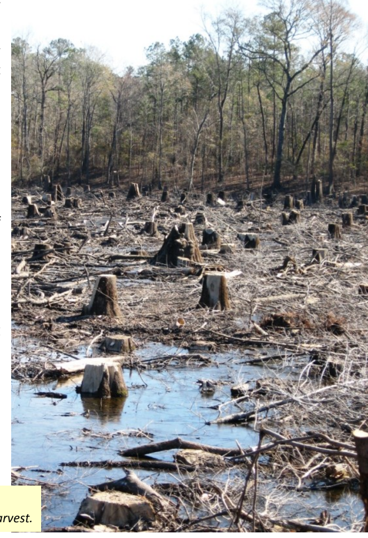
Photo of a swamp forest in eastern North Carolina immediately after harvest.