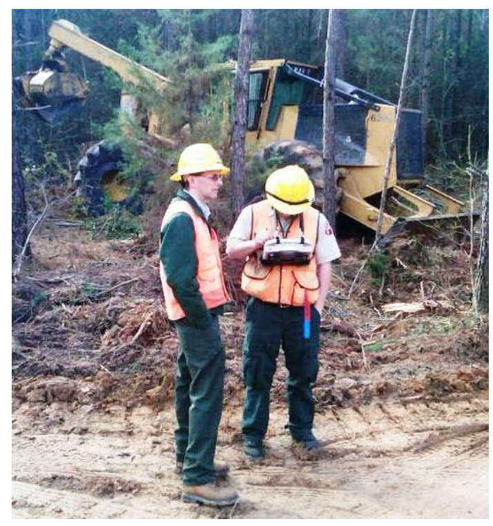
Photo at right shows two NCFS personnel on a logging job, with the employee at right using one of the new touch-screen computers to record information about the logging job.

To read two recent BMP monitoring reports for North Carolina and the southeastern U.S., click on the photo illustration of each report.