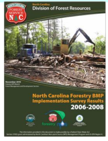
2011 North Carolina Report

To read two recent BMP monitoring reports for North Carolina and the southeastern U.S., click on the photo illustration of each report.