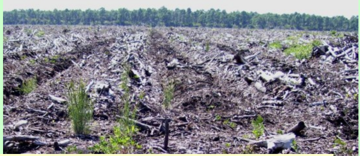
Two sites that have been bedded and prepared for planting new pine seedlings.

Conducting site prep in wetlands is especially challenging and requires careful planning and execution. There are <u>6 federally-mandated BMPs when conducting mechanical site prep</u> in wetlands for establishing a pine plantation forest. These 6 BMPs were initiated in 1995 by a guidance memo produced by the USEPA and U.S. Army Corps of Engineers. The 6 BMPs are listed in <u>Chapter 6 of NC Forestry BMP Manual.</u>