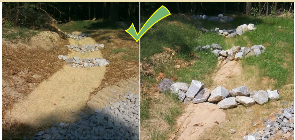
Erosion control matting is shown in the two above photos of the same site. Left photo was taken immediately after BMP work was completed. Right photo shows the same site, a few months later. This is a good example of "BMP stacking", or using multiple BMP tools to achieve the desired solution. In this case, (1) a turnout was installed, (2) erosion control matting was applied, (3) rock check dams were installed, and (4) grass seed and straw were spread.

Issue Number E.4.13 Eastern Region BMP Newsletter Update Page 3