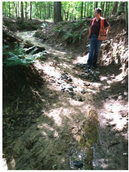
The type of channel shown above, which only receives water after it rains, may be included as a federally-protected "waters of the US," based on some interpretations of the new proposed rule.

The forestry community across the nation is working to provide constructive comments and feedback. As part of that outreach effort, the N.C. Forest Service and N.C. Dept. of Agriculture and Consumer Services hosted a meeting and brief tour of a forestry site with staff from the US-EPA at the end of September, at the <a href="Stan Adams Training Center">Stan Adams Training Center</a> on <a href="Jordan Lake Educational State Forest">Jordan Lake Educational State Forest</a>. As notable progress occurs with this proposed rule, we will provide updates in future newsletters.