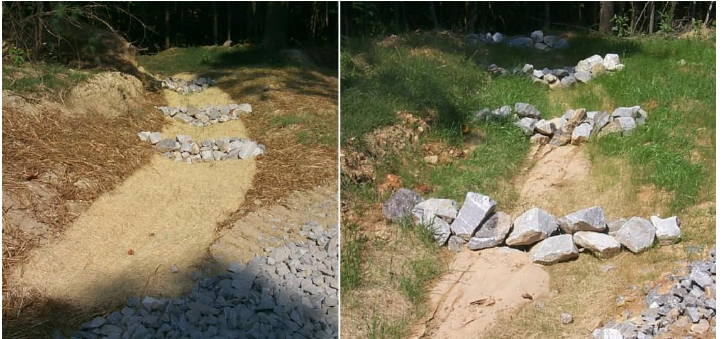
Erosion control matting is shown in the two above photos of the same site. Left photo was taken immediately after BMP work was completed. Right photo shows the same site, a few months later. This is a good example of “BMP stacking”, or using multiple BMP tools to achieve the desired solution. In this case, (1) a turnout was installed, (2) erosion control matting was applied, (3) rock check dams were installed, and (4) grass seed and straw were spread.