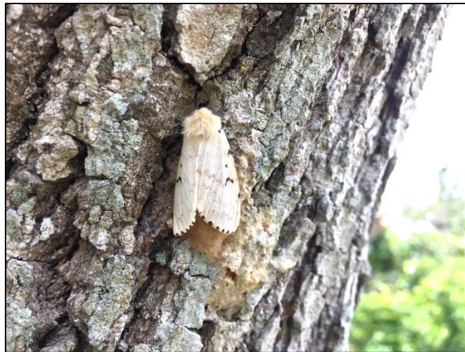
A female gypsy moth and her egg mass, picture taken by Chris Elder (NCDA&CS – Plant Industry) in Buxton, NC.

Determining Treatments. In addition to this year's trap counts, trap counts over the past several years and results from winter egg and pupal case surveys help to determine what treatment is most appropriate for a suspected infestation. Combined, these data can reveal with more confidence whether a location is infested with a reproducing gypsy moth population or if the moths caught were likely blown in during a weather event, usually denoted by a few moths found in scattered traps.