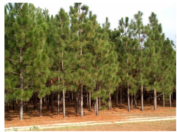
A longleaf pine plantation managed for pine straw production.