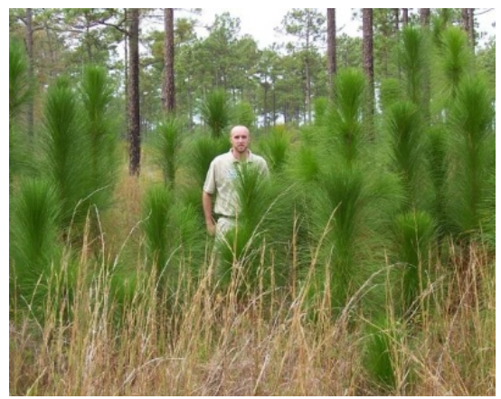
Longleaf pine trees in the sapling growth stage.

Containerized longleaf pine seedlings are available to purchase from the N.C. Forest Service state nursery, as well as from commercial nurseries. For more assistance in determining if longleaf pine is suitable to grow on your forestland, speak with a registered forester or contact your county forest ranger office. More information is also available on the website, <u>www.ncforestservice.gov</u>.