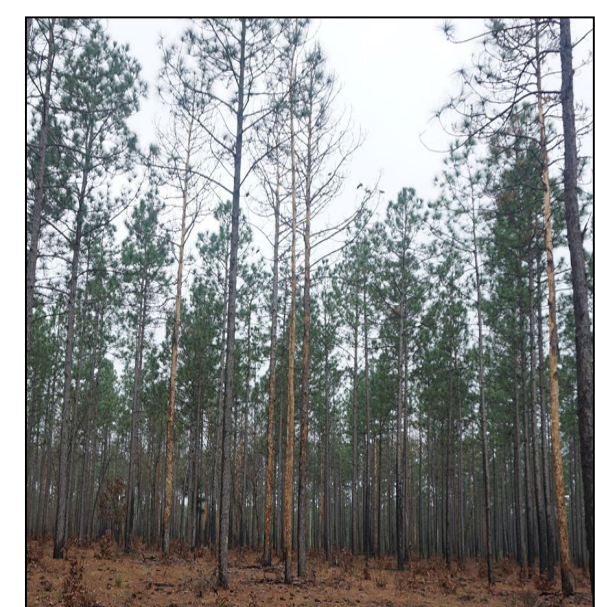
Longleaf stand with 40 percent tree loss after lps infestation. Stressors included sandy soils, overcrowded stocking, and raking/burning during a drought.

Raking furthers stress by removing needles that provide nutrients as they decay and that act as a mulch to preserve soil moisture. Combine these stresses with a drought and it is more than the tree can take. Ips beetles seize upon the opportunity.