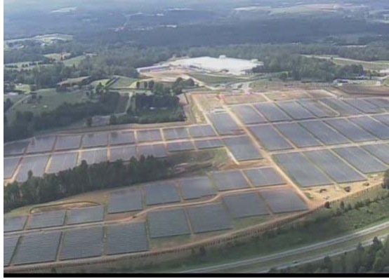
Apple's massive solar farm in Maiden, N.C.