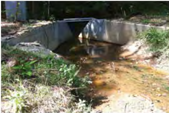
Orange County, NC. This is one of several stream monitoring structures we installed across central North Carolina with cooperation from landowners.