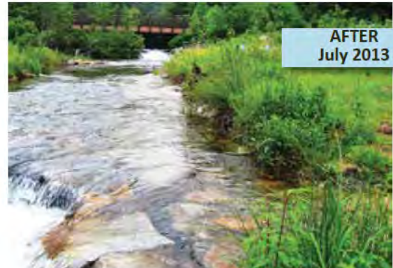
AFTER July 2013

Minor repair warranty work was completed by the stream restoration contractor along the Lake Julia Outfall (Reasonover Creek) at DuPont State Recreational Forest. This segment was initially restored in May 2011. Due to excessive rainfall in the last couple of years, a short section had washed out.