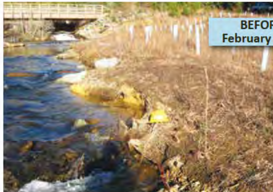
BEFORE February 2013