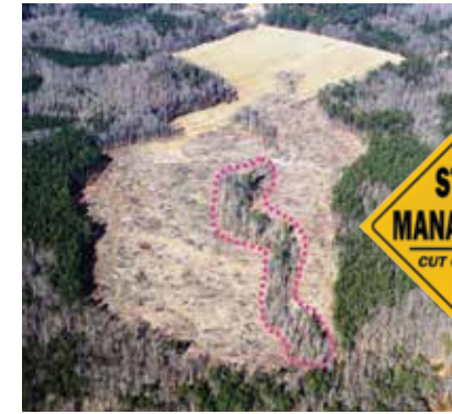
Good Skid Trail

Understand, implement, and maintain Best Management Practices - BMPs - when managing your forest.