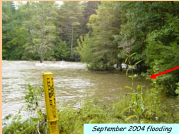
September 2004 flooding

The remnant rains from Tropical Storm Ivan in 2004 resulted in catastrophic flooding across the mountains of North Carolina.